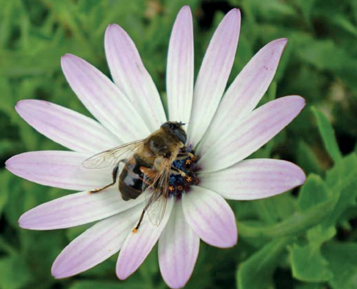
Osteospermum

It's August again and the sun has got his hat on, hip, hip, hip, hooray! All our hard work over the previous months has paid off and it's been worth it. So this month we can relax a bit and enjoy the gorgeous flowers and shrubs with their lovely colours and scents.