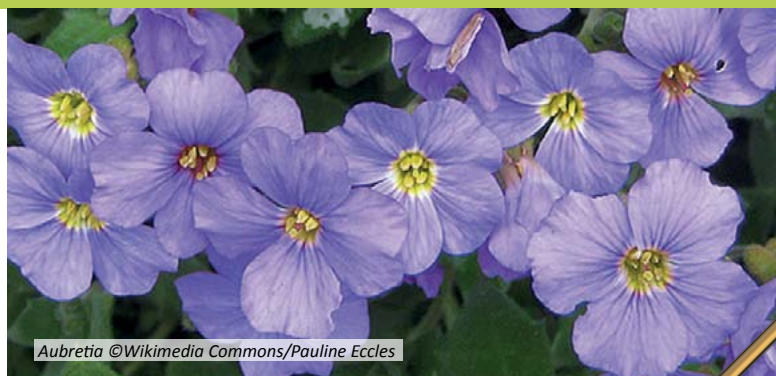
Aubretia

Towards the end of this month you can sow hardy annuals directly into the borders. They will overwinter and flower next summer.