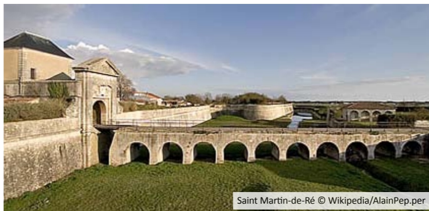
Saint Martin-de-Ré

Pointe de la Fumée near Fouras. You visit the island on foot, by bike or on board a horse-drawn carriage.