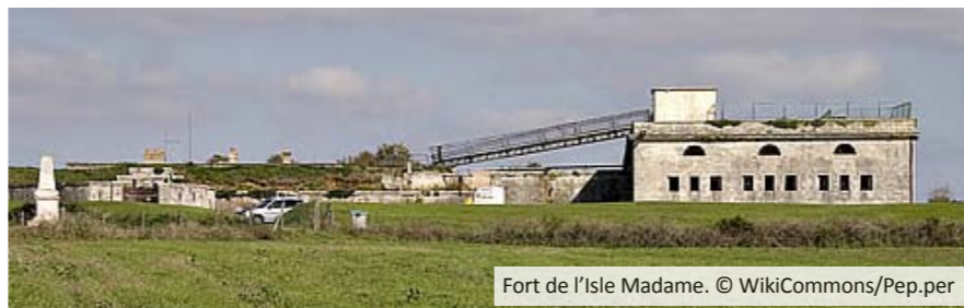
Fort de l'Isle Madame.