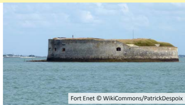
Fort Enet