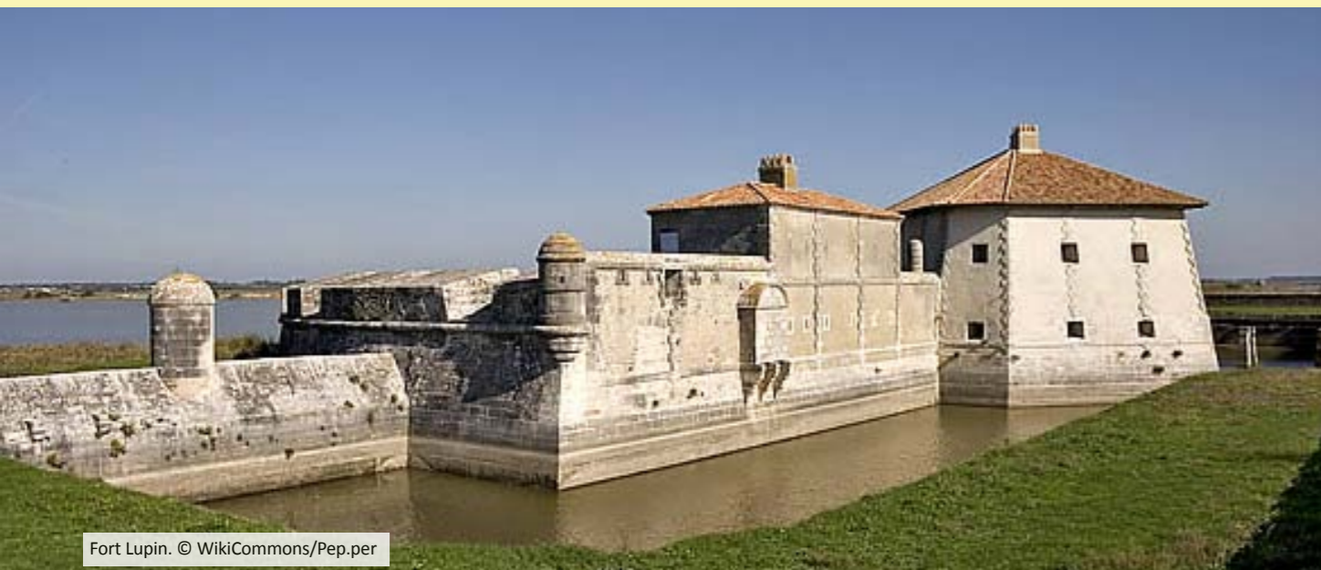
Fort Lupin.