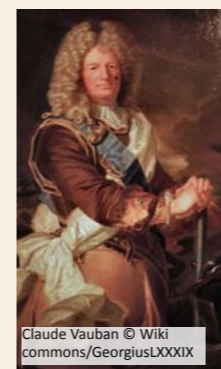
Claude Vauban

Sébastien Le Prestre de Vauban (1633-1707) is considered one of the greatest ever military engineers. Responsible for the fortification of more than 160 sites in France alone, his major contribution to warfare was in his methods of attack, which revolutionised siege warfare.