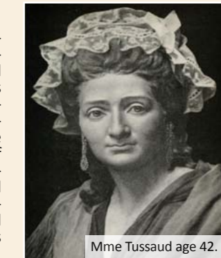
Mme Tussaud age 42.

Marie Grosholz dies. Arrested during the French Revolution along with her friend Joséphine de Beauharnais (who later married Napoleon), she escaped the guillotine after offering to make wax death masks of some of the most famous victims, including Marie Antionette and Robespierre. She later married a chap called Tussaud and took her new-found skills to London.