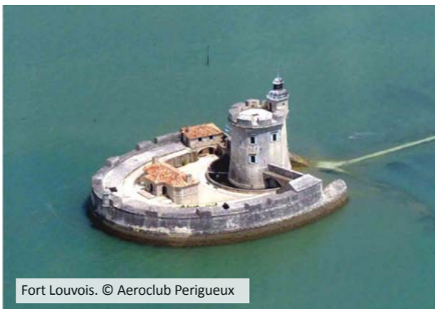
Fort Louvois.