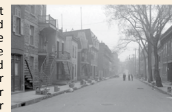
Clean Up Week

With incredible foresight into recycling, he ordered each household to have three rubbish bins – one for general household waste, a second for paper and fabric and a third for glass, crockery... and oyster shells!