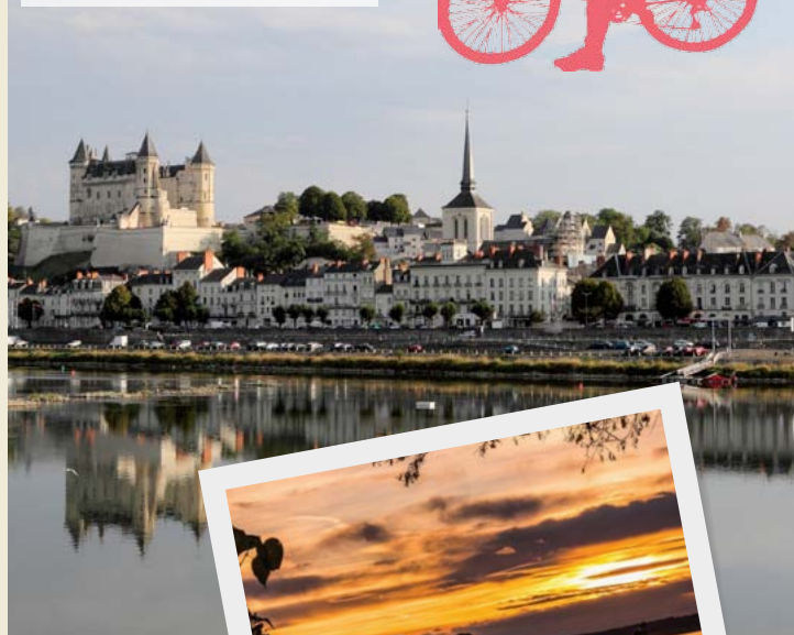
Below: The town of Saumur.

Tourisme en Gatine, 8 rue de la Vau St Jacques, 79200 Parthenay. Tel: 05 49 64 24 24. E: tourisme@gatine.org www.gatine.org