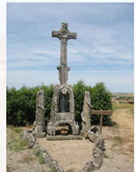
Above: St Martin's Cross